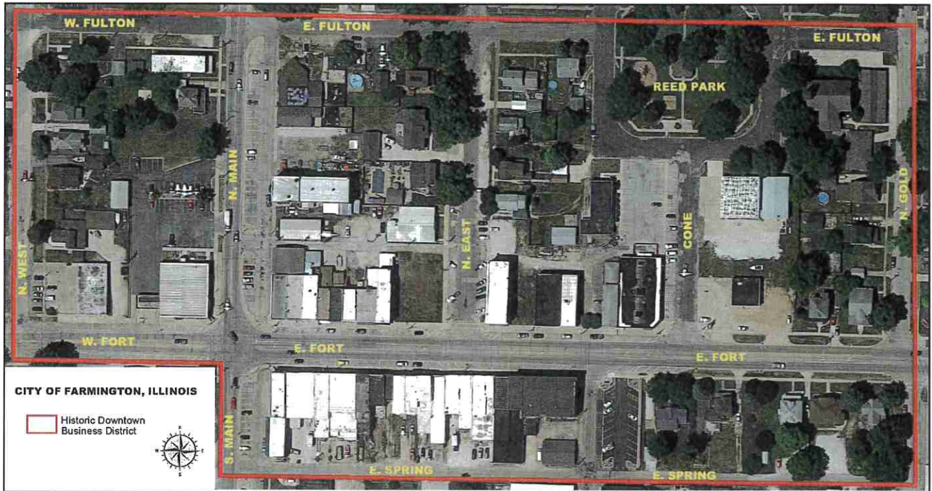
Figure 1. City of Farmington, Illinois, Historic Downtown Business District is also within the Farmington Tax Increment Financing District.

The Farmington FY 2025 Commercial Façade Renovation Program (the “Program”) is designed to stimulate economic growth and visibly enhance the Historic Downtown Business District (HDBD), which is also located within the Farmington Tax Increment Financing (TIF) District Redevelopment Project Area. The boundaries of the HDBD include a portion of the City of Farmington as depicted below (Fig. 1).